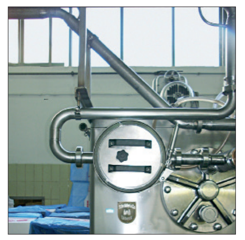
LIQUIMAG magnetic separator installed in a pipeline.

Tel: +49 8554 308-0 Fax: +49 8554 2606 info@sesotec.com www.sesotec.com